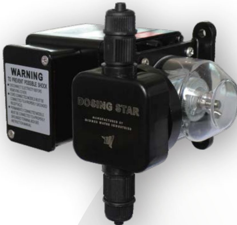
DOSING STAR DOSING PUMP